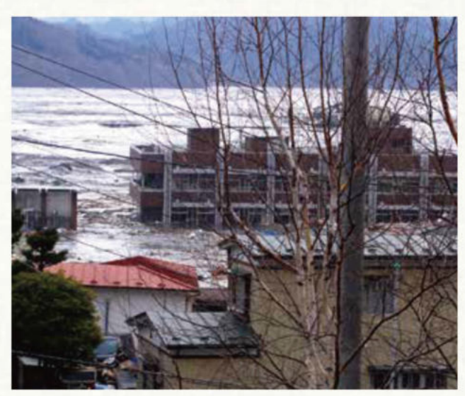
The International Coastal Research Center hit by the tsunami

Otsuchi is a small town in Iwate Prefecture with population of 13,000. The fishing industry has always played an important role in the area. Most of the buildings and fishing-related facilities at the heart of the town were destroyed by the disaster. About 10 percent of the population was killed or remain listed as missing. One of the most important tasks today is to find a way to revive the town and rebuild its fishing facilities.